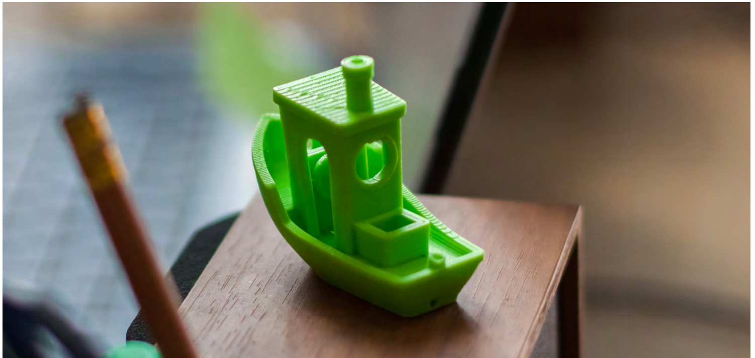
Rui Sha, 3D Modeling and Printing