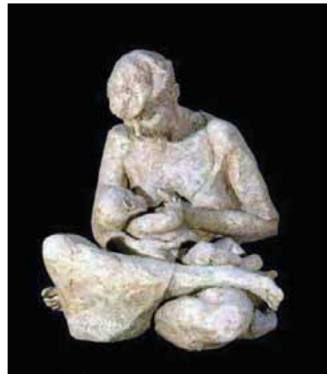
EAC Faculty Member Sheila Oettinger

Monitored Studio Time fees vary from studio to studio. Use Code 8251, $80 per session, available to currently enrolled figure sculpture students. (Use Code 8251A for $25 weekends only)