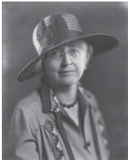
Alice Riley Society